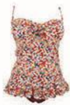
2 piece Tankini