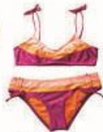
2 piece Bathing Suit